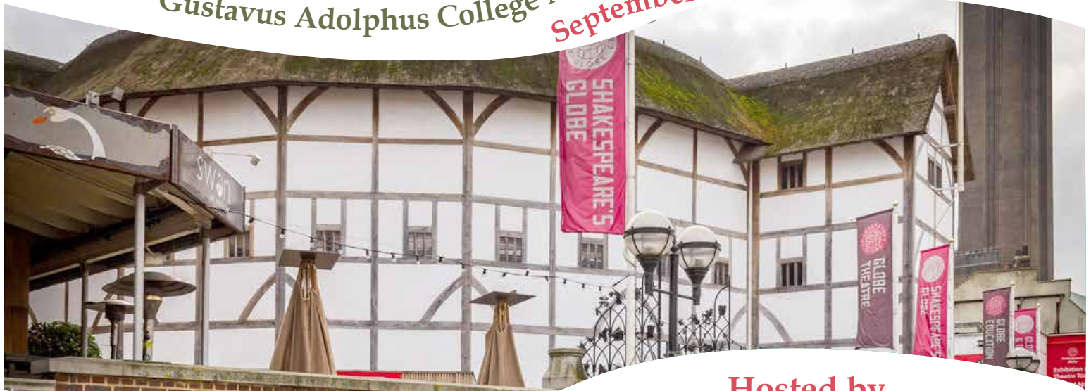
Photo: London's Globe Theatre