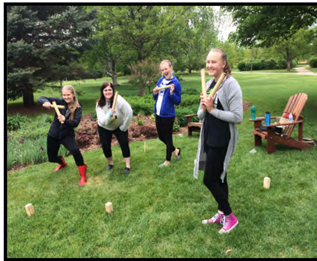
Wellness Day - Playing Swedish game of Kubb after a session of yoga for juniors & seniors and potential Gusties.