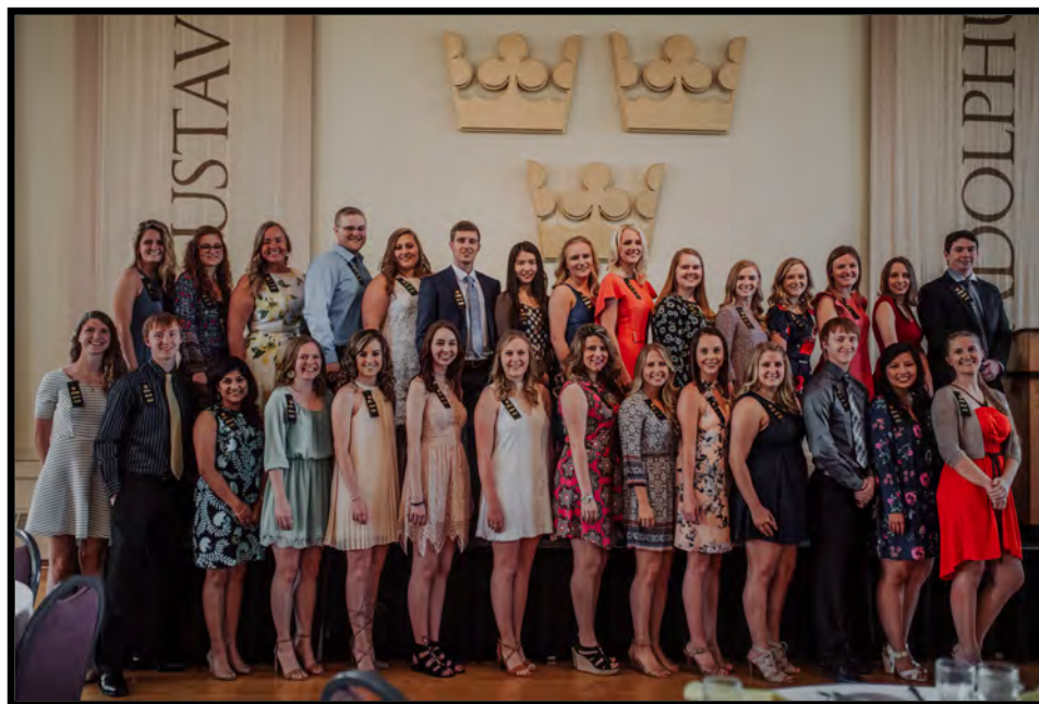
The Pinning Ceremony for the Nursing Class of 2017 was held on May 6, 2017.