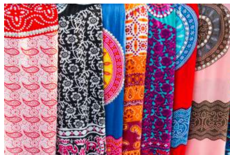
Clockwise from left: Christ Church, Malacca; traditional batik fabric, Malaysia; Gardens-by-the-Bay and Super Trees, Singapore