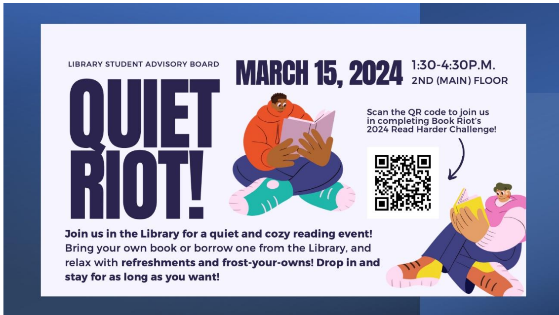
Above: The Library sponsored a reading challenge in March 2023.