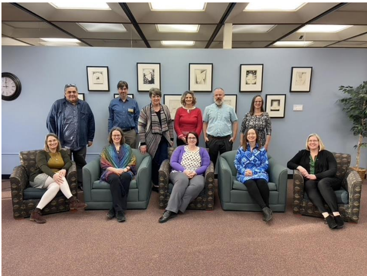
Left: A staff photo taken in December 2023 for the yearbook.