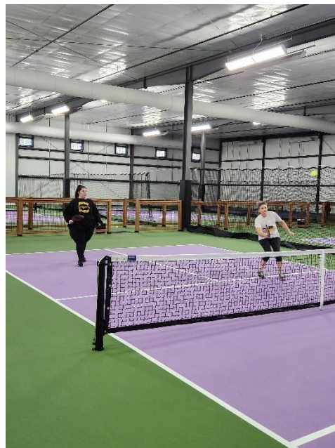
Above: The Staff Enhancement committee organized a half-day retreat that included a pickleball clinic.