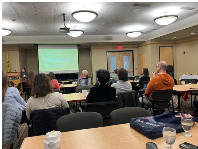
Above: Gustavus hosted the Spring 2023 MnObe gathering.