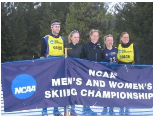
NCAA Championships in Bozeman, MT