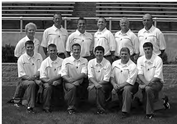
2006 COACHING STAFF