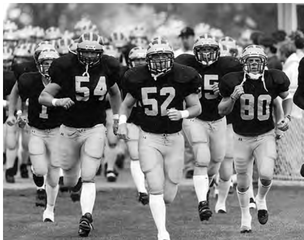
THE GUSTIES CHARGE THE FIELD!