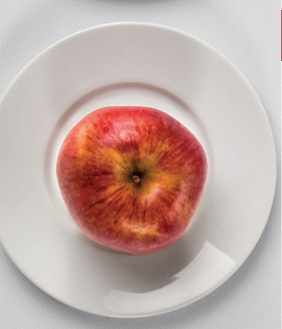
For more information, visit gustavus.edu/ nobelconference/2010

Daily, we are reminded of the importance of correctly answering this question—a question whose urgency can only partly be accounted for by our rumbling stomachs. Our health is determined to no small extent by our choice of diet—at least for those eaters fortunate enough to be able to make choices. The health of planetary ecosystems similarly depends upon the foods we choose to grow—and how we choose to grow and process them. The economic wellbeing of persons around the globe is, to a significant degree, determined by the workings of the industrial-agricultural food system. If health, ecology, and economy aren't incentive enough, our food choices also bear considerable aesthetic and cultural significance; food is an important vehicle for transmitting and preserving ethnic heritage, regional identity, and cultural pride, to say nothing of enjoyment and pleasure. Walking down the aisles of a supermarket, scanning the menu in a restaurant, peering into our refrigerators, we find ourselves asking of our choices, "Is it nutritious? Ecologically sustainable? Affordable? Appropriate to my cultural/spiritual beliefs? And, will it taste good?"