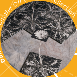
Banuelion from the Off the Wall collection