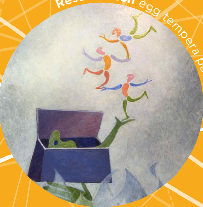
Resurrection egg tempera painting