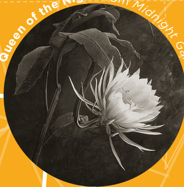
Queen of the Night from Midnight Garden Series