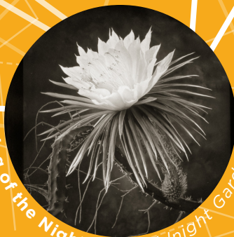
King of the Night from Midnight Garden Series