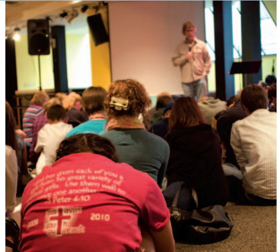
This marks the fourth year for Student Leadership Day at Gustavus.