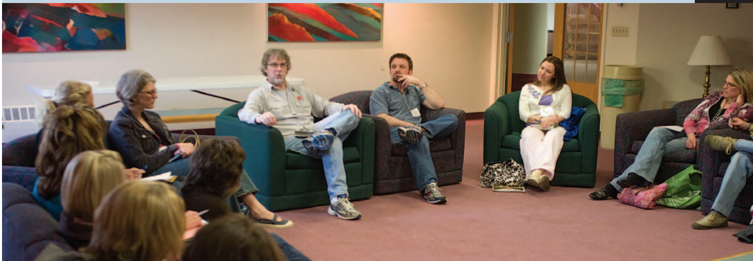
Round table talks for youth ministry staff and volunteers, and small group discussions for high school students, will offer a forum for reflecting on principles of leadership and sharing practical ideas.