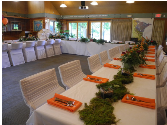
Inside the Interpretive Center