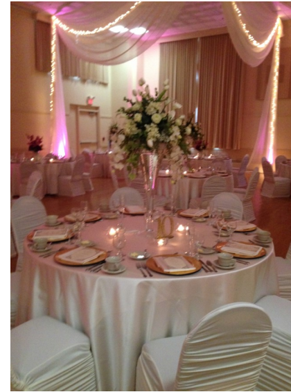
Reception by Gustavus in Alumni Hall