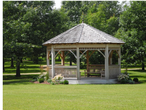
Gazebo—great location for ceremonies