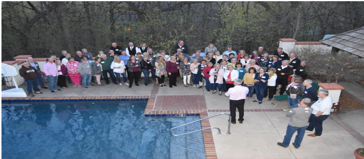
The Big Party Group 1

Summer is winding down. I'm certain that Gustavus is very active, in the first weeks, ready for another class of first year students as well as upperclassmen anxious to be back to campus to spend time with their friends. There is really nothing like Gustie camaraderie and I know that all of you remember as well as I do how much fun those first days back on campus were every year, reconnecting with friends we had not seen over the summer months. I'm guessing the current students will have every bit as much fun doing so as we did, but they probably spent the summer months connected to one another via Skype, Facetime, Instagram, texts and maybe even a Facebook post or two.