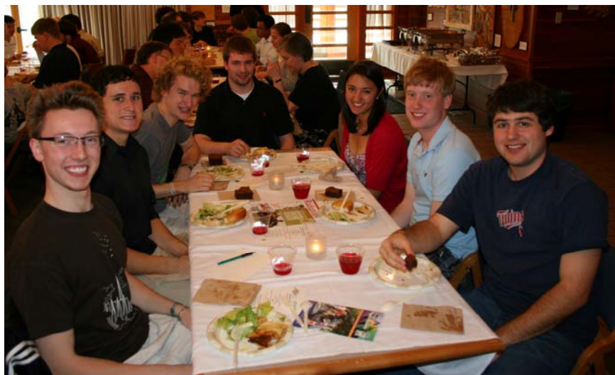
Students enjoy the banquet

your lawn counting each blade of grass.”