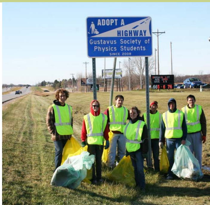
Twice a year the Gustavus SPS cleans a section of US Highway 169

SPS also involves students in community service and