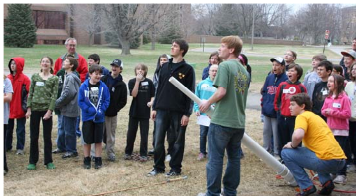
Gustavus SPS students fire their “potato cannon”, much to the delight of the elementary school students at “Science on Saturday”