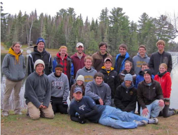
SPS October camping trip to the Soudan mine

outreach activities. Each fall, during the College’s annual Nobel Conference®, the SPS students put on a physics demonstration show for the general public. They also participate in Gustavus’ Science on Saturday program which attracts area students from elementary and middle schools. For an afternoon each spring, the SPS plays host to the entire sixth grade from St. Peter North Intermediate School.