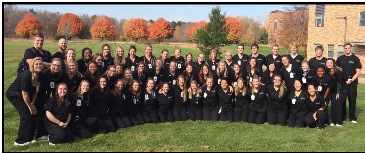
Class of 2018 & Class of 2019