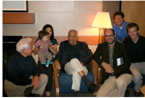
Derek Walcott and the Gustavus Classics Department.

Odysseus may have rejected Calypso's offer of blissful immortality on Ogygia, but his fame lives on in the works of artists from Dante to Cavafy, from Tennyson to Joyce. They pay Homer the ultimate artistic compliment, that of emulation. In their hands, his hero Odysseus, "the man of many turns," reappears in countless guises. In his Epistulae ex Ponto and Tristia , for example,