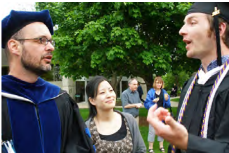
The student becomes the teacher and the teachers become the students.