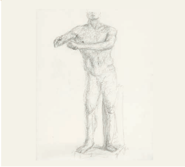
Nicholas Beck drawing