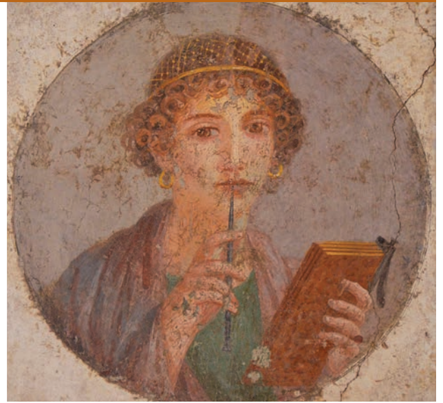
Wall paintings from Pompeii

ancient world and the way that people have used the ancient past to explore questions of identity. The activities of the past year were off the charts for this introvert but I wouldn't trade it for anything. The echoes continue to reverberate in the work I'm doing now and will, I'm sure, for the rest of my life.