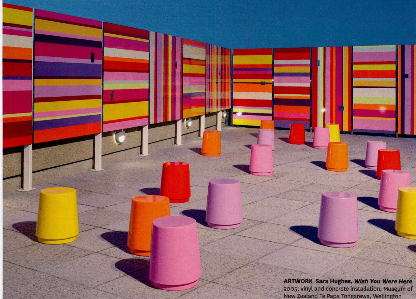
ARTWORK Sara Hughes, Wish You Were Here 2005, vinyl and concrete installation, Museum of New Zealand Te Papa Tongarewa, Wellington

Growth in the global economy is fueled above all by entrepreneurship—the nature of which has changed dramatically in recent years.