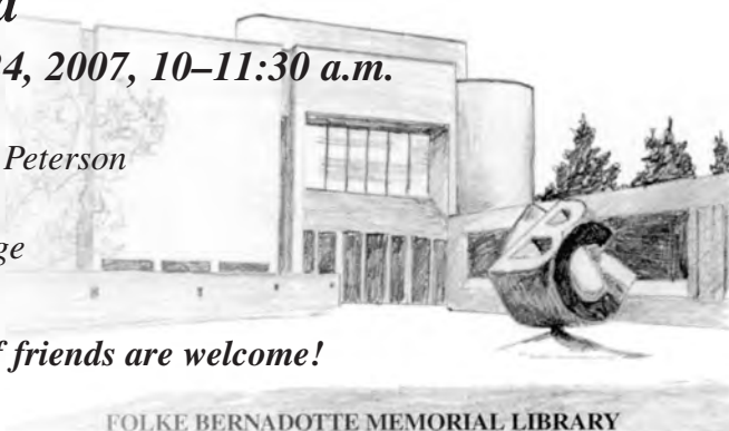
FOLKE BERNADOTTE MEMORIAL LIBRARY

All friends and friends of friends are welcome!