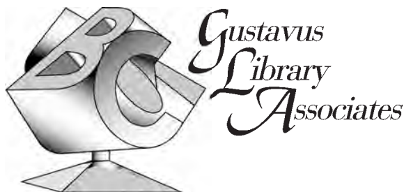
BC AD • 1973 • 48-inch bronze cube • Sculptor Paul T. Granlund

GUSTAVUS LIBRARY ASSOCIATES Gustavus Adolphus College 800 West College Avenue Saint Peter, MN 56082