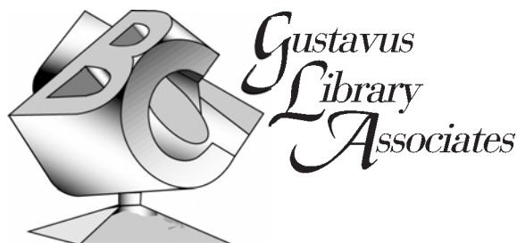
BC AD • 1973 • 48-inch bronze cube • Sculptor Paul T. Granlund

* The Acquisition Membership gift is determined by the average cost of one library acquisition.