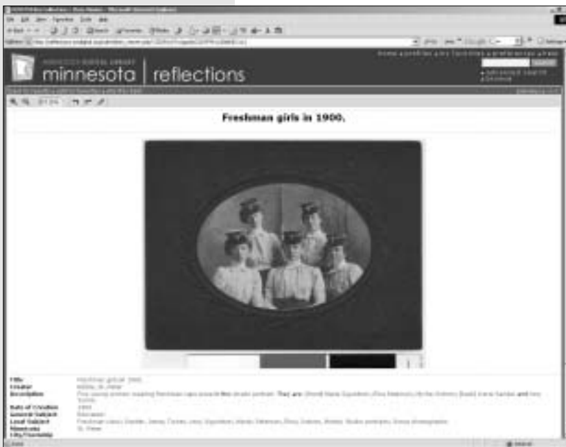
Screen capture of the Minnesota Digital Library website.