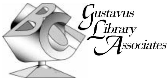
BC AD • 1973 • 48-inch bronze cube • Sculptor Paul T. Granlund

GUSTAVUS LIBRARY ASSOCIATES Gustavus Adolphus College 800 West College Avenue Saint Peter, MN 56082