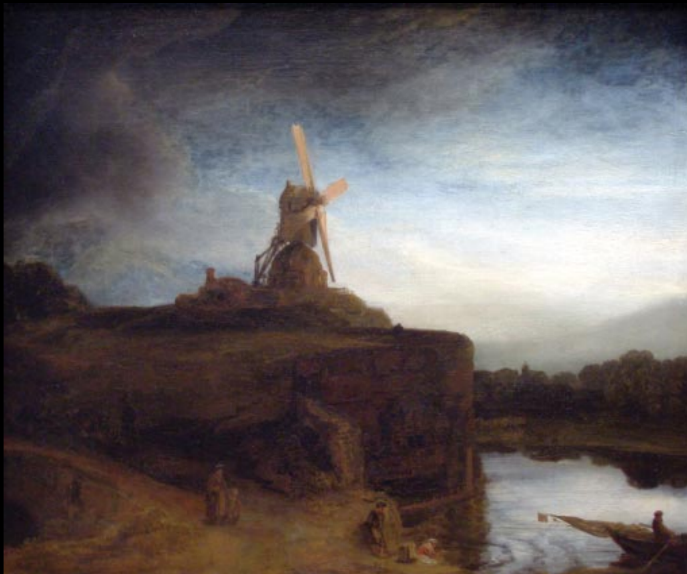
Rembrandt van Rijn, The Mill , 1645/1648, oil on canvas, 34 1/2 x 41 5/16 inches., National Gallery of Art, Washington, D.C.