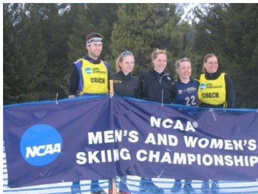
NCAA Championships in Bozeman, MT