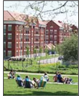
On campus at Växjö