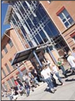
On campus at Växjö

Applications are available in the Office of International Education.